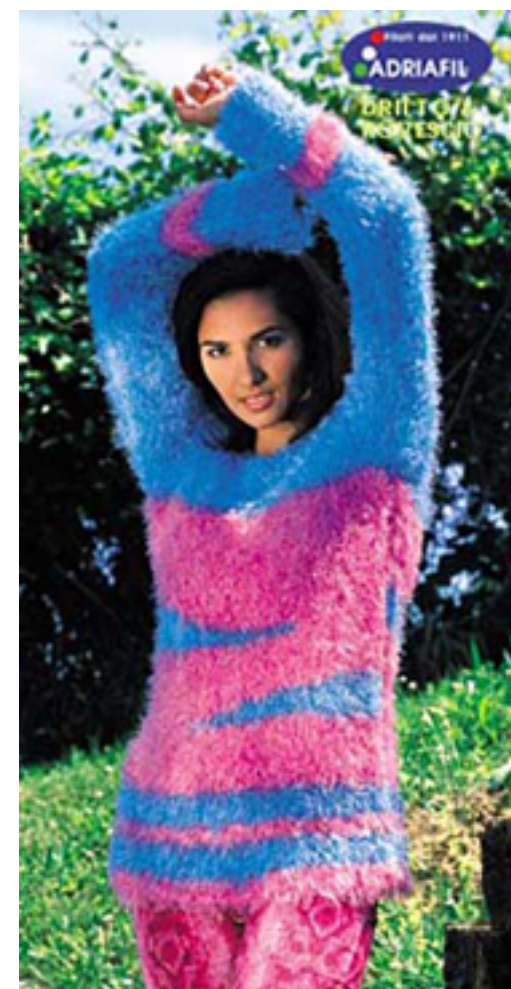
34 mod giacca Light ai ferri e a uncinetto